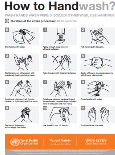
How to Handwash

Access to printable GAA branded signage is also available via the GAA learning portal <a href="https://learning.gaa.ie/covid19resources">https://learning.gaa.ie/covid19resources</a>