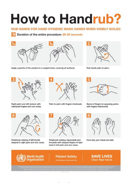
How to Handrub