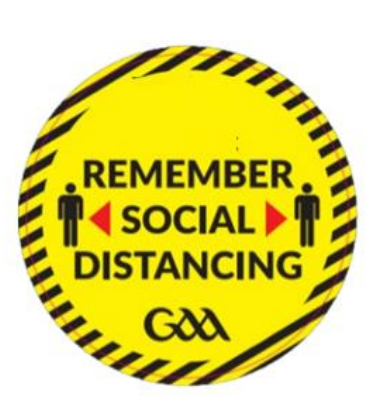
Floor sticker sample